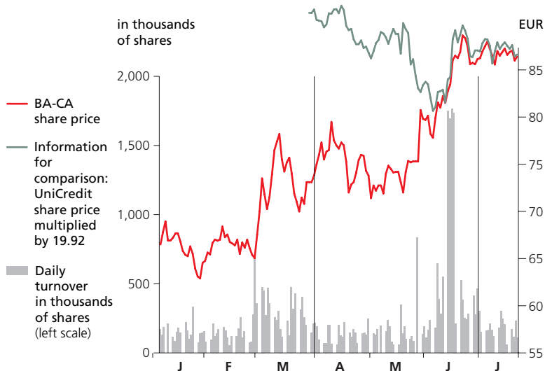
BA-CA shares – performance and turnover in H1 2005

In Austria , real GDP returned to somewhat stronger expansion in the second quarter, though growth rates were weaker than in the previous year. Despite the tax reform, domestic demand failed to compensate for the lack of export orders (also due to rising energy costs). In CEE , the growth rate compared with the previous year was slightly higher than in the first quarter, but this reflects the base effect of the record performance a year before. The Czech Republic and Slovakia benefited from robust growth (direct investment, car exports), while Poland experienced a slowdown due to weak investment. Overall, we estimate that growth in CEE countries in the second quarter reached over 4 %, after 3.6 % in the preceding quarter. Romania and Bulgaria were the top performers, with growth rates of over 6 % and over 5 %, respectively. In the financial sector, volumes continued to expand at rates significantly exceeding nominal GDP growth. The CEE currencies were slightly weaker against the euro than at the beginning of the year. But as a result of appreciation in the second half of 2004, they were still much stronger than in the previous year: Polish zloty +16 %, Czech crown +8 %, Slovak crown +5 %, Hungarian forint +3 %, Romanian leu +10 % (six-month averages as against previous year).